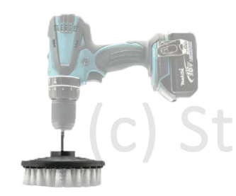
Medium duty polypropylene brush for solid FRP